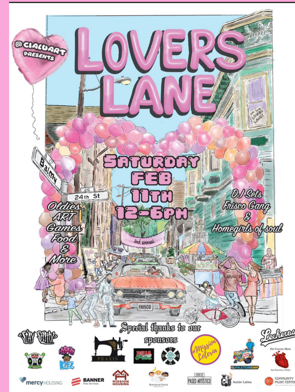
Flyer from second year 2023