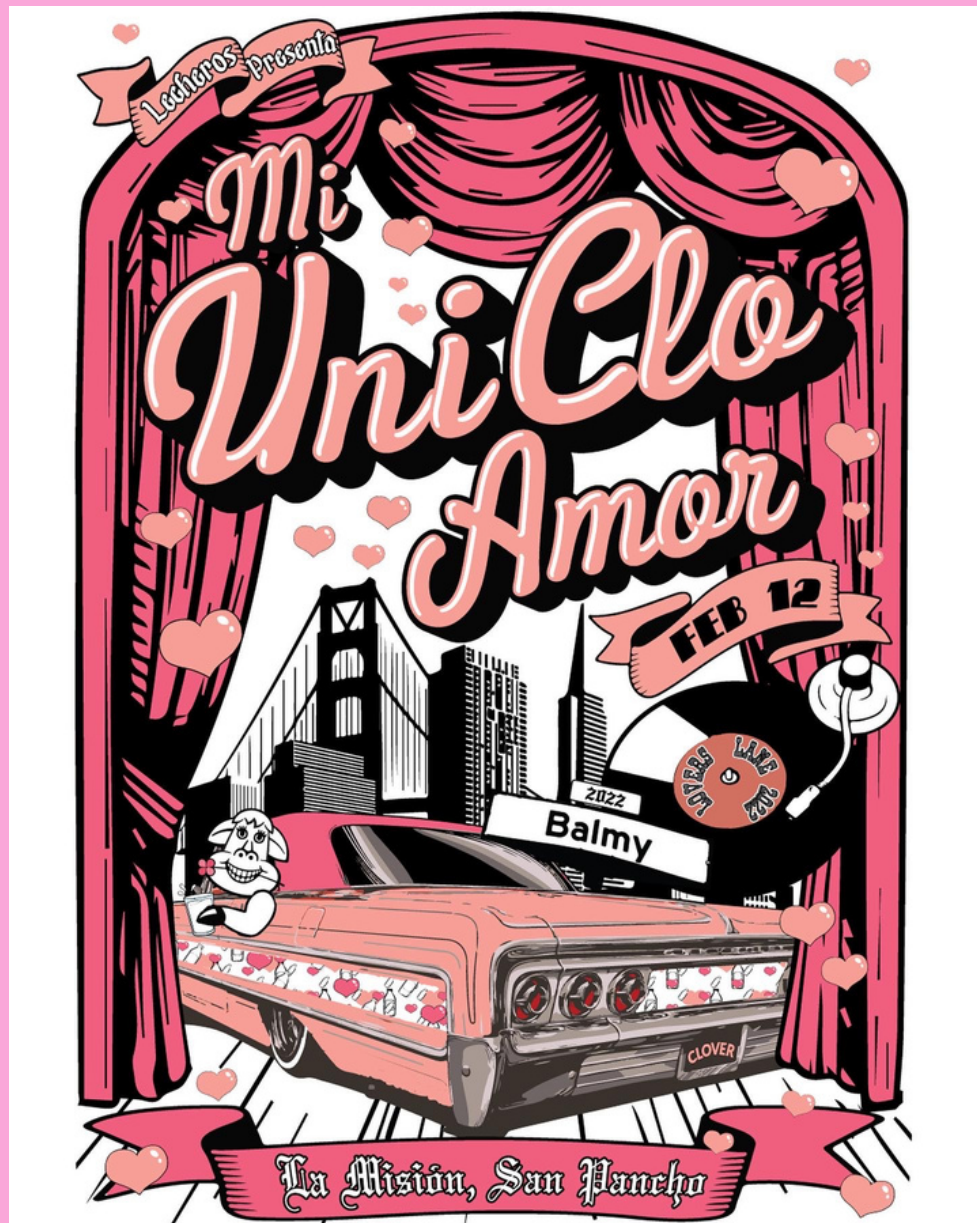
Collaboration with Clover Sonoma

Each Lover's Lane produces an original collaborative poster to commemorate this momentous event.